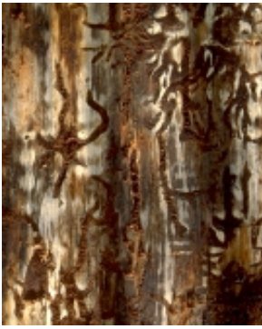
Figure 6: Ips galleries on pinyon.

and silk produced by the larvae. Larval feeding over the summer causes most of the damage. Generations take one to two years.