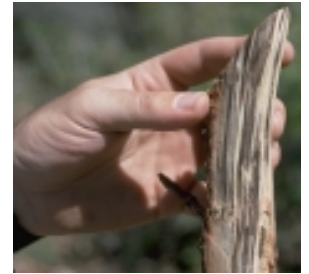
Figure 1: Vertical staining from black stain root disease.

This vascular disease causes extensive black staining of the sapwood in the root and lower stem before killing the sapwood. Bark beetles tend to follow as secondary pathogens and eventually cause the death of the tree. Spread occurs through root grafts and root contacts, and by insects that carry the spores (reproductive structures of the disease). Affected trees usually are in a group.