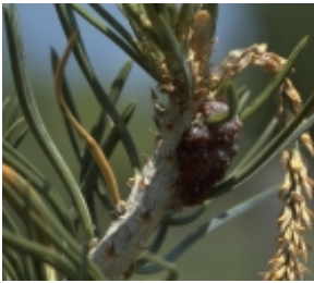
Figure 7: Pinyon tip moth.