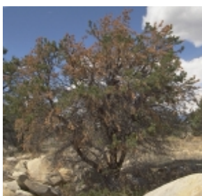
Figure 4: Erratic branch mortality of pinyon decline.