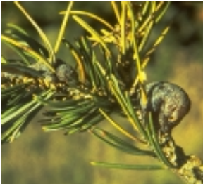
Figure 8: Pinyon pitch nodule moth.

mine the pith of the terminal growth, causing more damage as they grow. Large larvae move on to new tissue, cones or shoots. Pupation occurs inside the terminals and cones. Adults lay eggs from late June through August. There is one generation per year.