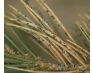
Figure 9: Pinyon needle scale.

Females overwinter on the needle as a legless nymph that resembles a small black bean. Development into the mobile adult form resumes in the spring. Mating occurs in early April. Eggs are laid in masses around the collar, branch crotches and underside of larger branches. The eggs are covered by a white, cottony wax. Newly hatched nymphs settle on the previous year's needles. Second stage nymphs form in late summer and overwinter on the needles. There is one generation per year.