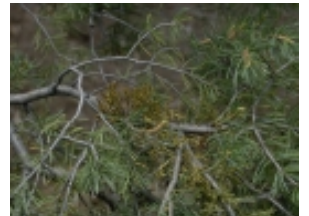
Figure 2: Dwarf mistletoe broom and plants.

These are small, leafless, parasitic flowering plants that grow on branches and spread only to other pinyon pines. They kill slowly by robbing the tree of its nutrients and water. Reproduction occurs when sticky seeds explosively discharge from the plant and adhere to the branches and needles of their next host. The life cycle from germination to dissemination is six years. This relatively slow rate of spread allows time for appropriate action.