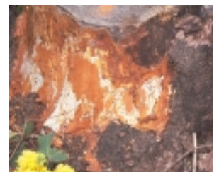
Figure 3: White fungal fans of Armillaria spp.

Armillaria spreads along roots and by rhizomorphs (fungal-root-like structures). One tree or a group can be attacked. The fungus can subsist on dead, woody material for more than 35 years. Armillaria prefers to infect trees that are already stressed by environmental factors or other pathogens. It prefers moist sites and moderate temperatures and is rarely found on extremely hot, cold or dry sites.