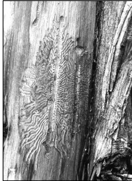
Appearance of cedar bark beetle galleries beneath the bark (approximately life-size)

David Leatherman and Damon Lange Colorado State Forest Service September 1997